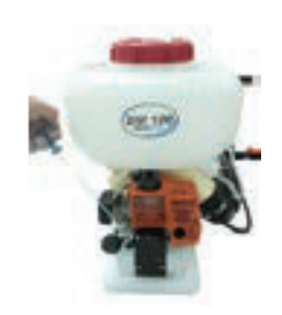
3. Quickly pull the starter until the engine is running