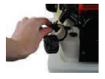
2. Remove fuel filter