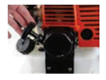
After the engine has started, slide the choke knob down slowly to the opened position