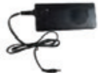
20 Battery Charger